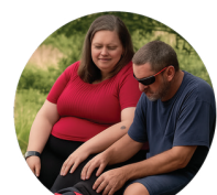
FACES OF HOPE Documentary: personal accounts of Anoka residents with opioid misuse, followed by a panel discussion